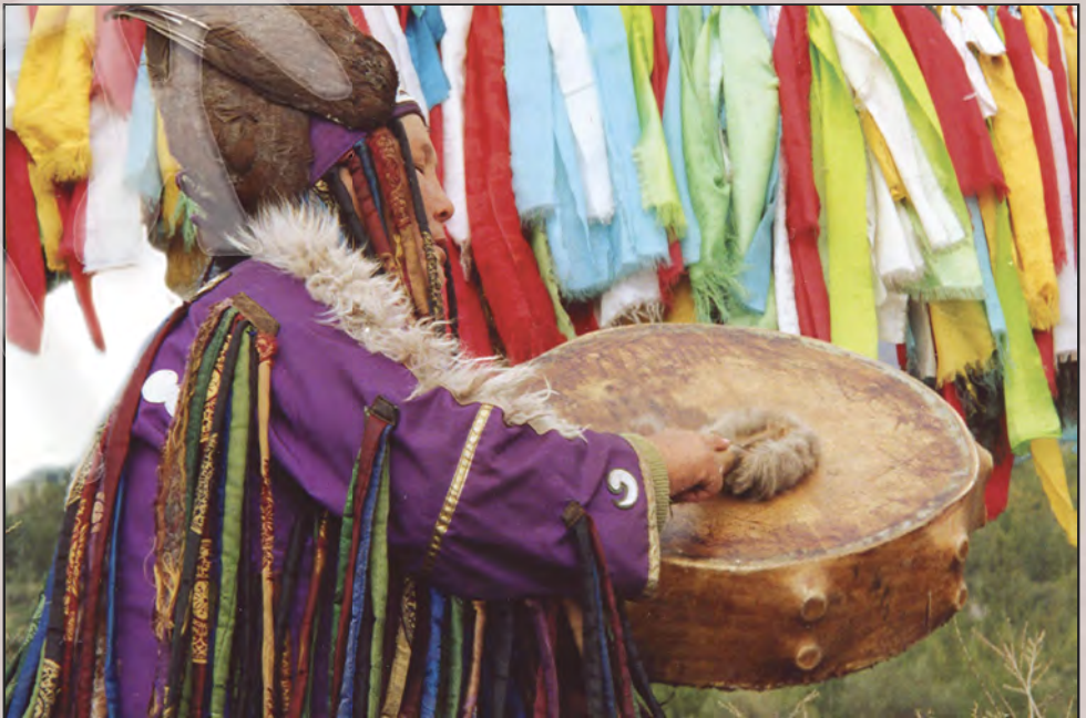
Woman Tuvan Shaman